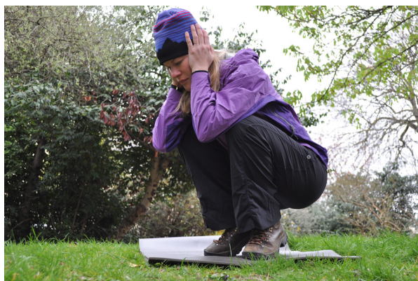
Figure 3. Lightning position.

The lightning position involves sitting or crouching with knees and feet close together to create only one point of contact with the ground (Figure 3). If standing, have feet touching. If sitting, lift feet off the ground. Take this position only when a lightning strike is imminent and when all other lightning prevention strategies have failed. Signs of imminent strike include a blue haze around objects or individuals (St. Elmo's fire), static electricity over hair or skin, an ozone smell, or a nearby crackling sound. Attempt to minimize the risk of ground current injury by insulating oneself from the ground; sit on a pack (remove any metal from the pack), a dry coiled rope, or a rolled foam sleeping pad. This is a strategy of last resort, as it is a difficult position to maintain for a long time, and should not be relied on as primary prevention but may reduce the risk of injury from an imminent lightning strike. 25 Recommendation grade: 2C.